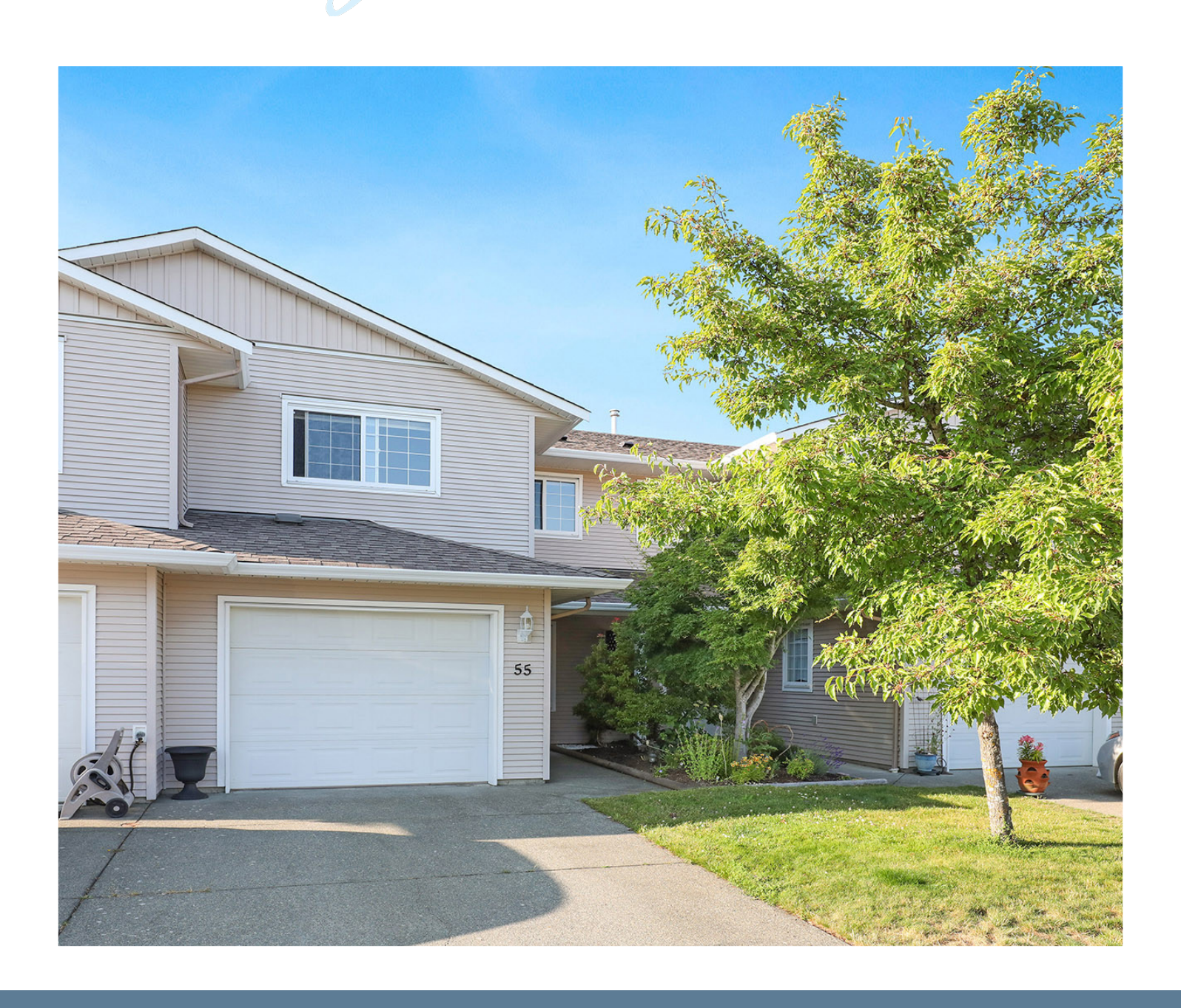
55-717 Aspen Road