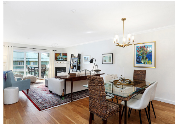
502 - 2275 COMOX AVENUE