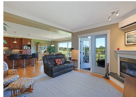
534 - 3666 ROYAL VISTA WAY